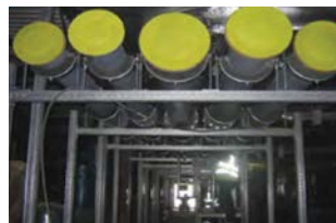
Plant Accessory Versatility