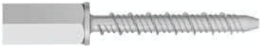
Rod Hanger Head (8 x 60 mm)