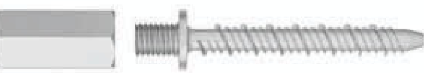
Rod Hanger Head (6 x 40 mm)