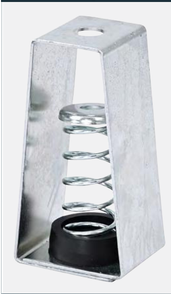
VIBRAMOUNT Hanger Box Kit Compact Series