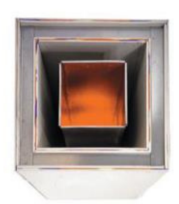
Traditional bulky protection with gypsum or vermiculite based wall shaft

Fire Barrier Duct Wrap 615+ offers advantages in project planning, as it allows other trades to continue to work in close vicinity to the installation of Duct Wrap 615+. A significant advantage is also that Duct Wrap 615+ can be applied off-site, or at point of duct fabrication, offering even greater savings.