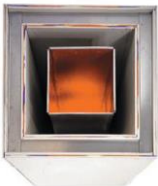
Traditional bulky protection with gypsum or vermiculite based wall shaft

Fire Barrier Duct Wrap 615+ offers advantages in project planning, as it allows other trades to continue to work in close vicinity to the installation of Duct Wrap 615+. A significant advantage is also that Duct Wrap 615+ can be applied off-site, or at point of duct fabrication, offering even greater savings.